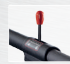
7 RESISTANCE LEVELS Braking system on 7 levels, from free run to a pushing

Lateral support and double frontal handgrip (low/high) that allows different pushing positions.